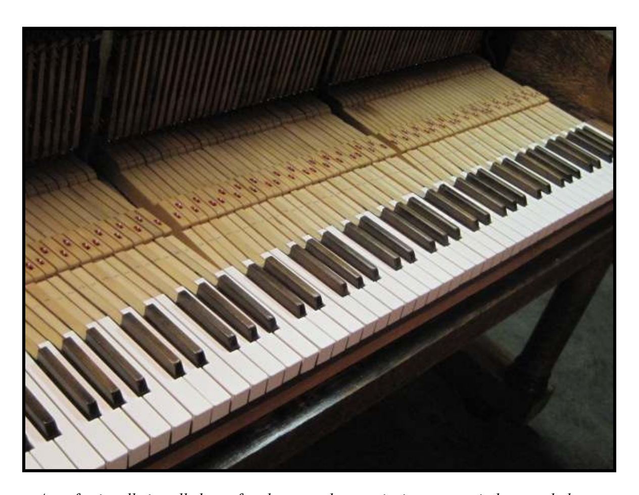
A professionally installed set of replacement keytops invites one to sit down and play.